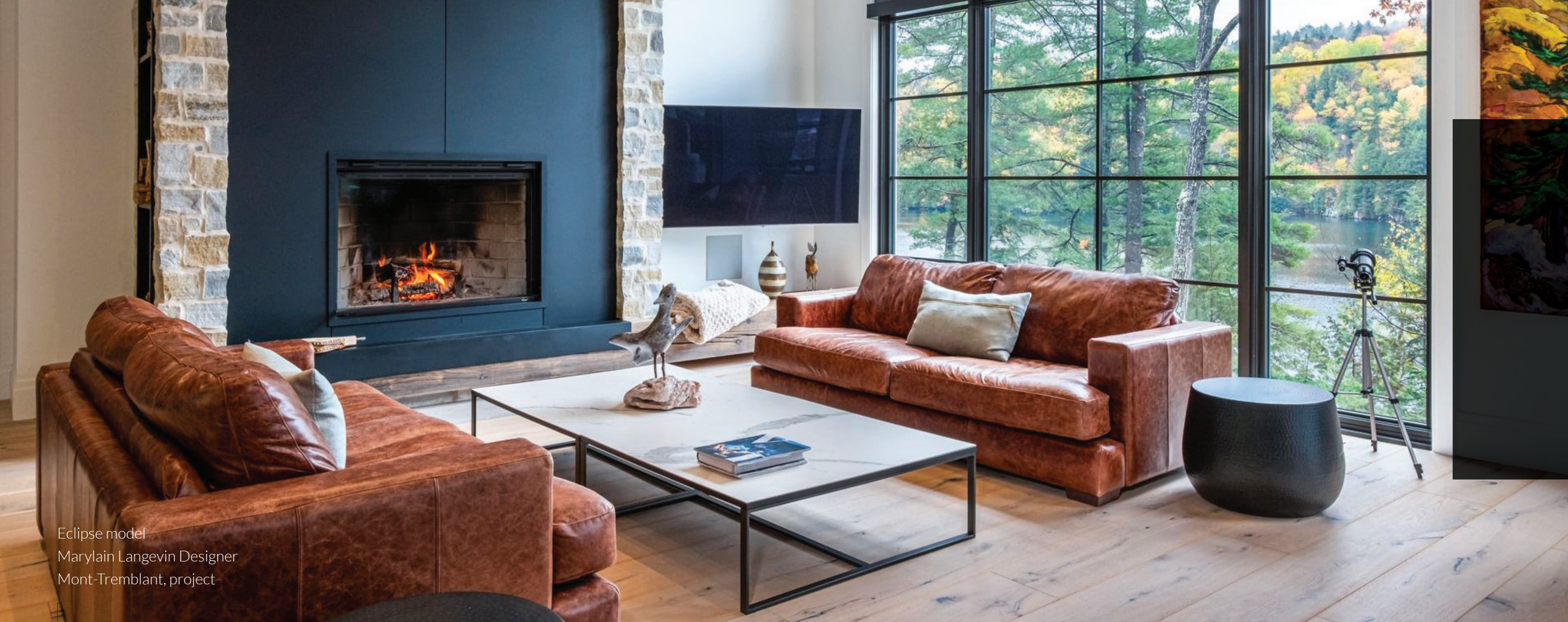
Eclipse model Marylain Langevin Designer Mont-Tremblant, project